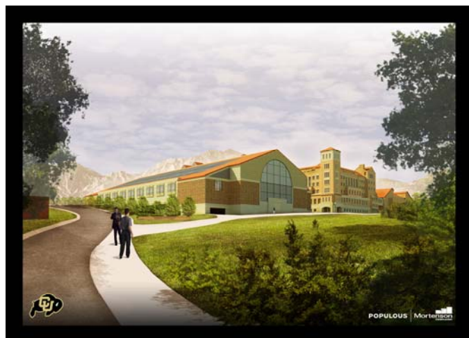
ABOVE: Renderings of CU's Athletics Complex Expansion, all three phases scheduled to be completed by the end of the year.